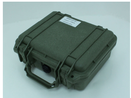
SHIPPING / STORAGE CONTAINER